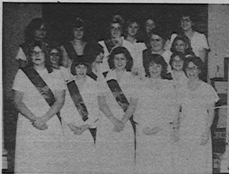
Members of Lilac Triangle